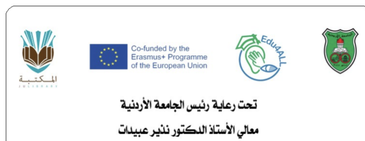
Figure 2. UJ Opening conference email