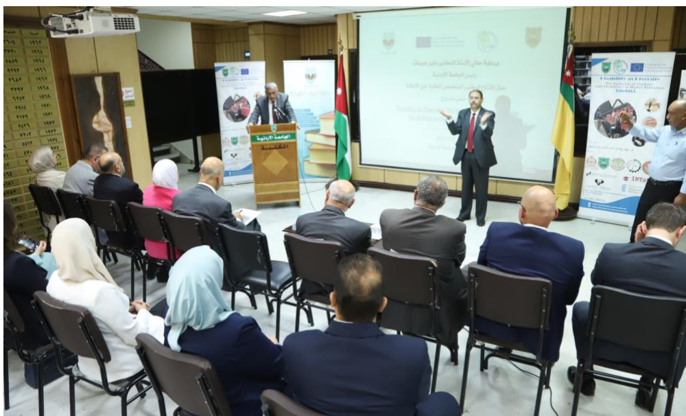
Figure 12. Sign language translator in the conference