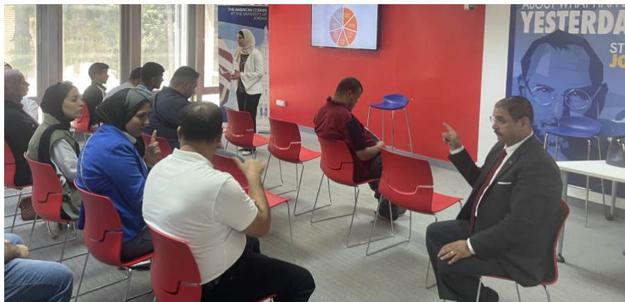
Figure 16. Committee of practice meeting with SwD -1