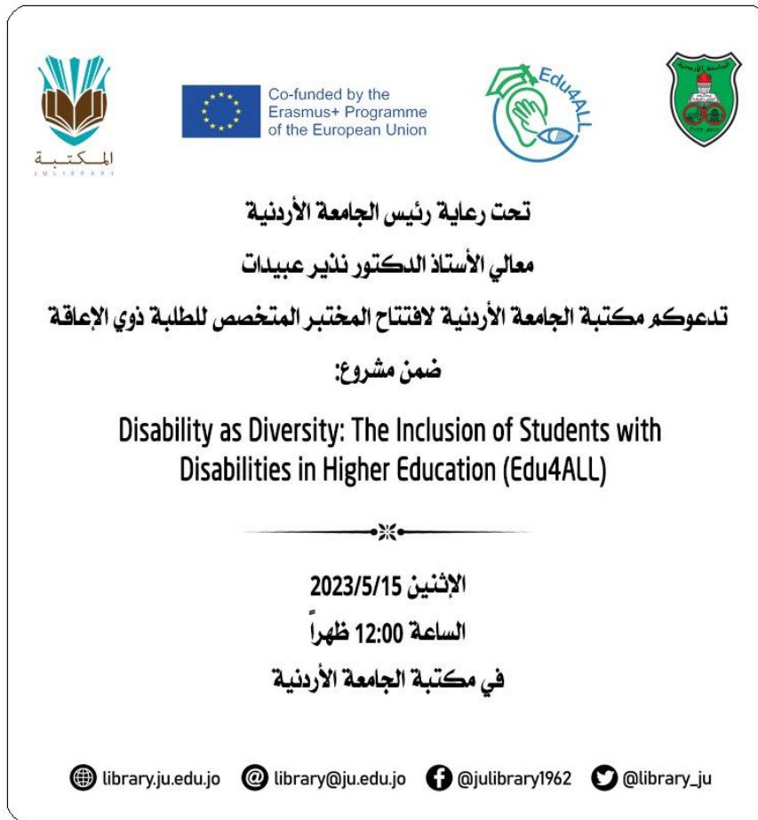
Figure 1. UJ opening conference Invitation

دعوة لافتتاح المختبر المتخصص للطلبة ذوي الإعاقة في وحدة المكتبة ضمن مشروع Disability as Diversity