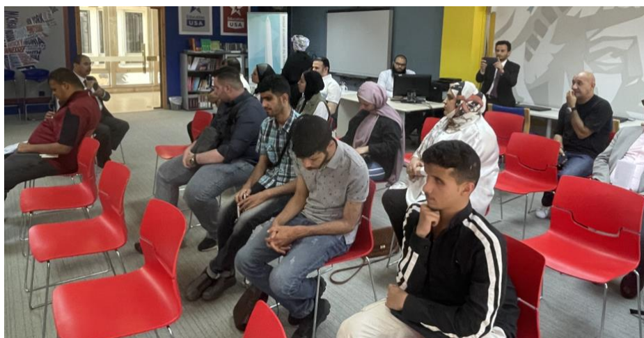
Figure 18. Committee of practice meeting with SwD -3