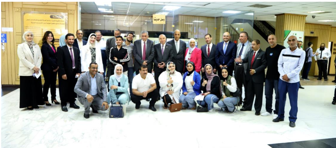
Figure 11. Group photo