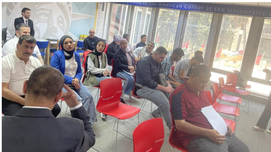
Figure 17. Committee of practice meeting with SwD -2