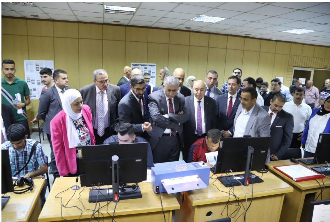
Figure 8. Students with Disability (SwD) try assistive Technology (AT) tools in the Unit