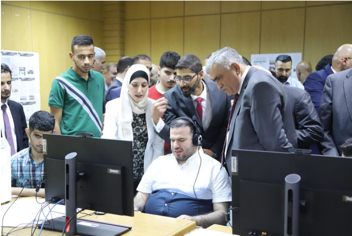
Figure 10. A blind student use screen reader tool